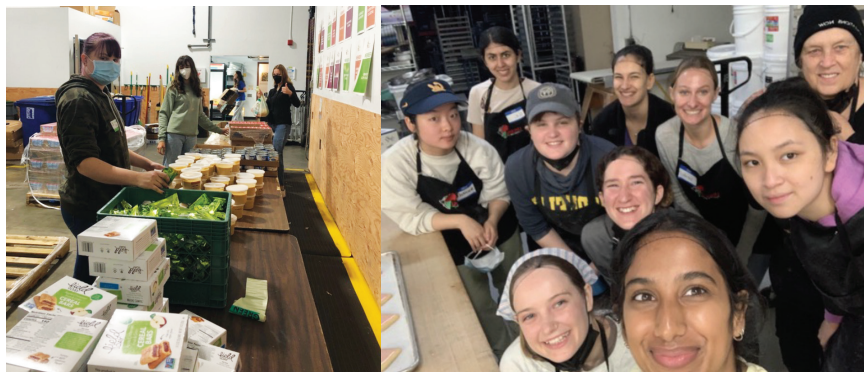
Berkeley Food Network-Community Service Event

One of the great things about being able to volunteer is the ability to see the tangible work and benefits it provides to the community. Our first community service event was at the Berkeley Food Network, where we helped bag, organize, and sort food that would be distributed to food insecure people within the Bay Area. During this event we learned about how the organization was mitigating food waste from restaurants and grocery stores and redistributing it to the hands of those in need. We also had the great opportunity to volunteer for Uhuru Foods and Pies which is a "Buy Black Power" institution that works on building economic development for the black community through selling their baked goods. Our members helped make tea and funnel the liquid into bottles, baked pies, and mixed, kneaded, and baked cookie dough as well as icing the cookies! Both events are pictured above! We are very excited for our next community service project on March 11 th where we will be helping Friends of Five Creeks by mulching, weeding, and planting starter seeds at Berkeley's only local trout stream!