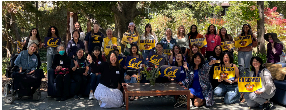
Summer Welcome Party, September 2022 With incoming freshmen students and their families, honor society actives, and alumnae.

You may also complete the contact form below via