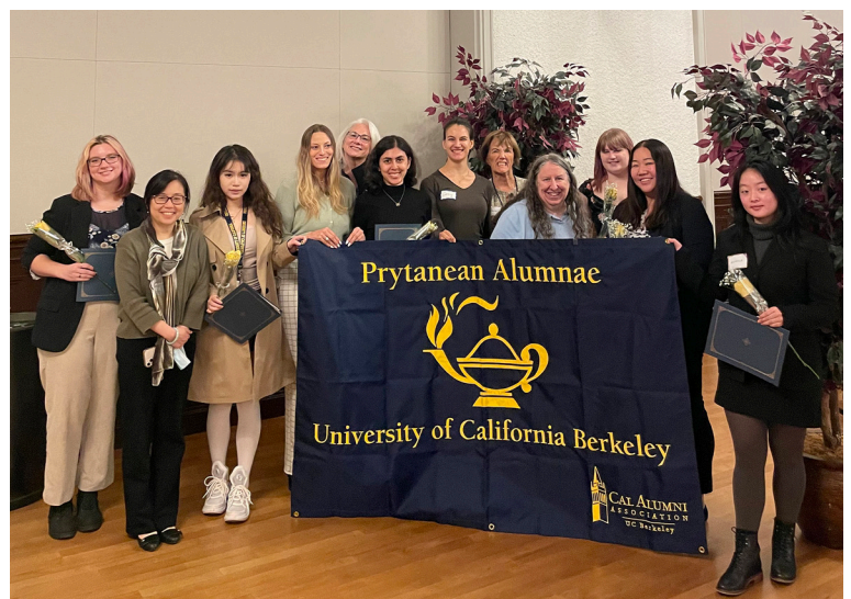
Fall 2022 Initiation With the newly initiated honor society members, honor society actives, and Prytanean alumnae at Slusser Hall, International House November 2022